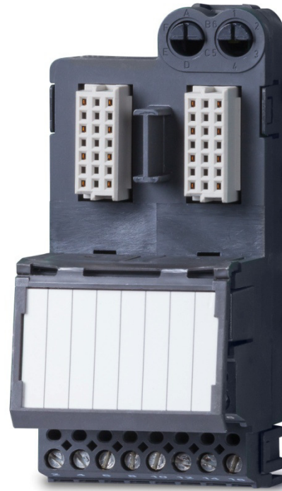
Traditional I/O terminal block.

Phased installation saves time. As soon as you mount the I/O interface carrier, you're ready to begin installing the field devices. I/O terminal blocks plug directly onto the I/O interface carrier. There is no need to have the I/O cards installed.