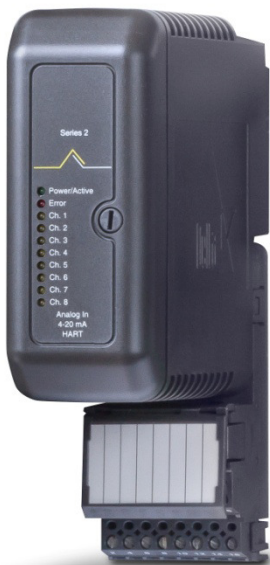
A Traditional I/O card easily plugs into an I/O carrier