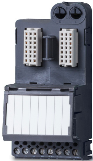
8 channel standard Terminal block

A variety of I/O terminal blocks are available to meet specific functionality and environmental requirements of the installation. The I/O interface is a combination of the I/O card and the I/O terminal block. Each I/O interface is uniquely keyed so that once installed in a carrier slot with a terminal block, that terminal block will only accept a replacement card.